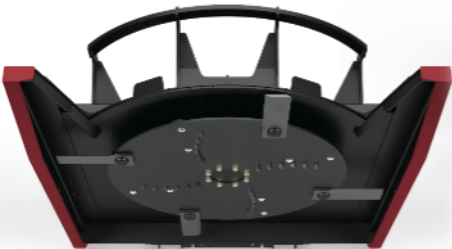
DETAIL UNDER DECK (Shown with Optional Teeth)